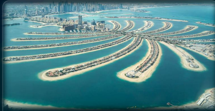
VIP Global Trip